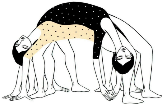
Kayla Maiuri '16 published a short story, "The Eldest," in BOMB Magazine .